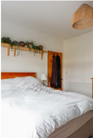
Wenvoe Terrace, Barry, CF62 7ES